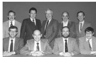
1987-88 Executive Committee