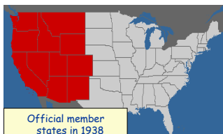
Official member states in 1938