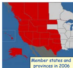
Member states and provinces in 2006